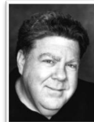
George Wendt, Actor - "Norm" from Cheers